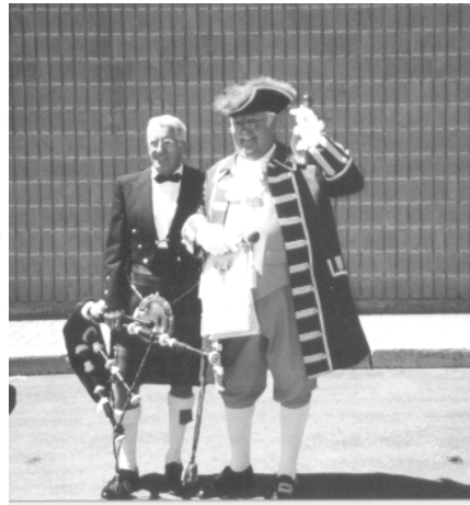
Cobourg PROBUS Club arrived with their own Piper and Town Crier