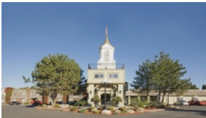
The Best Western Parkway Inn - you can't miss the tower

The venue is the Best Western Parkway Inn and they recommend taking 417 to Casselman then south on 138. About 3km south of 401 (138 is now Brookdale Avenue) turn right on 14th and the hotel is a block away at 1515 Vincent Massey Drive.