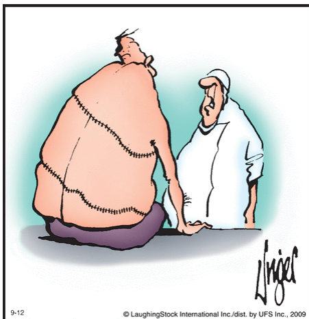
"You fell off the operating table."