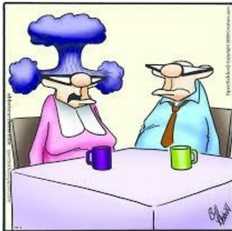
"My hairdresser couldn't understand what I was saying with my mask on."